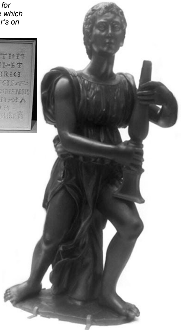
One of the four angel sculptures by the Florentine sculptor Benedetto da Rovezzano

The exhibition in the Wolsey Art Gallery, Ipswich will run from October 14 2017 to March 11 2018. This, following the highly successful showing of the John Constable 'rainbow' painting of Salisbury Cathedral in the same venue, has the makings of a major draw to Ipswich both locally, regionally and internationally.