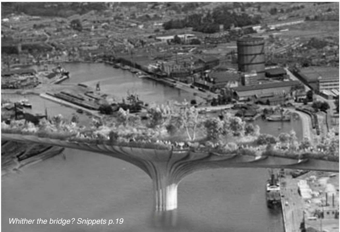
Whither the bridge? Snippets p.19