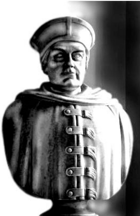
Bust of Wolsey displayed at the top of the main staircase in the Town Hall.

Plans are being drawn up for an exhibition to be staged, appropriately, in the Wolsey Art Gallery within Christchurch Mansion. The centre-piece will be the four sculptures of angels commissioned by the town's most famous son, Cardinal Thomas Wolsey, (perhaps typically) to preside over the grand, classical stone tomb he had commissioned for himself. The tomb was, after centuries, eventually 'recycled' for Lord Nelson in St Paul's Cathedral and is there today.