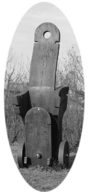
The Navigator on the River Path

There are always going to be a few nay-sayers who ask 'Why would anybody want to come to Ipswich?'. Visitors are impressed by the situation of the town with its historic Wet Dock, river foreshores, countryside and access to well-maintained parks and to the nearby sea coast. A bustling shopping centre contradicts the opinion (often held by those in the hinterland who avoid the town and go to Bury or Norwich instead) that Ipswich is just full of charity shops and phone shops. Look a little further and quality independent shops, department stores, upmarket chain outlets and a busy open market four times a week make it an excellent shopping destination. Oh, and contrary to commonly-held opinion, the Borough car-parks are affordable and we still have valuable Park & Ride services from Copdock Mill and Martlesham Heath.