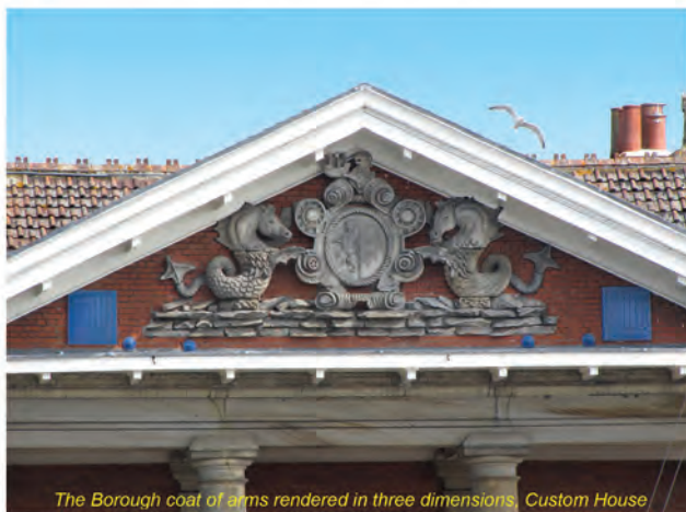
The Borough coat of arms rendered in three dimensions, Custom House

Exploring the historic Ipswich Wet Dock and surrounding area in short walks