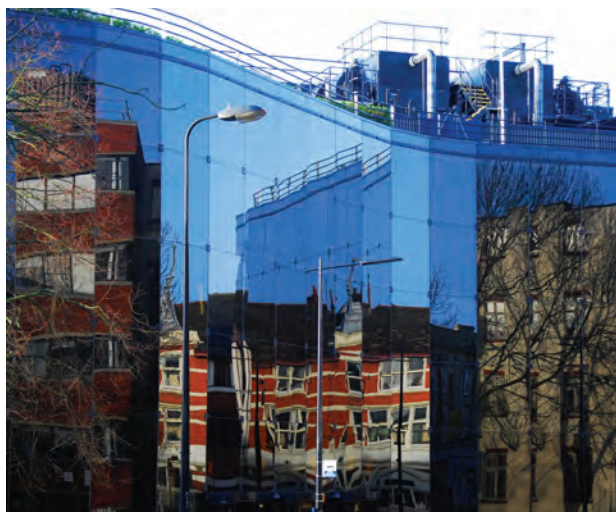
Left: Willis Towers Watson