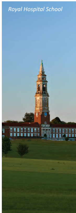
Royal Hospital School